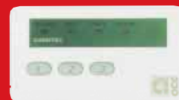
Gardtec ACE Receiver