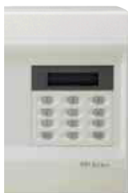
Control Panel with OnBoard Keypad option

A choice of keypad designs, providing robust and attractive alternatives yet offering simple operation means that the system can blend in the environment whilst providing full functionality.