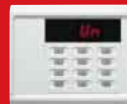
Gardtec 800 Traditional LED RKP