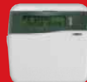
Gardtec Contour LCD RKP c/w ACE