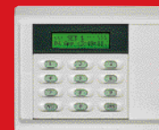
Gardtec 800 Traditional LCD RKP