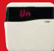
Gardtec Contour LED RKP c/w ACE